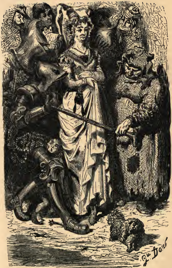
Above all was she strict in keeping hands off the maiden.